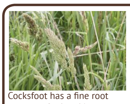
Cocksfoot has a fine root structure for breaking up compacted soil.