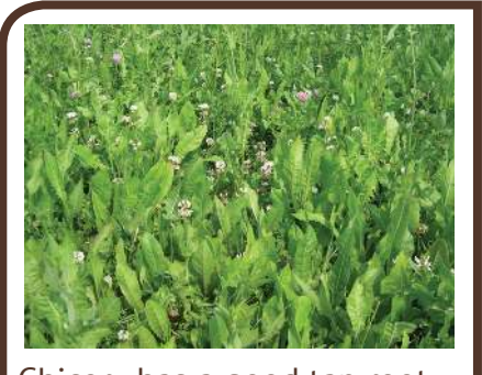
Chicory has a good tap root for breaking up soil pans.