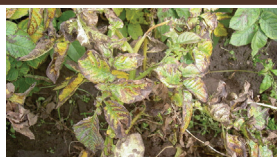
These potatoes are running severely short of potash

The most obvious signs of potassium deficiency are yellowing of the leaves at the edges. These later turn brown and extend to other parts of the leaves. It can be confused with wind burn or frost damage. Fruits especially tomatoes can have a poor flavour if they run short of potash.