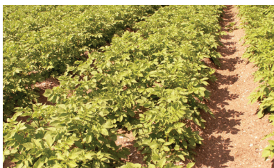
These potatoes are running short of nitrogen producing a stunted yellow canopy.