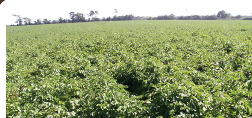
These potatoes received too much nitrogen and produced a tangled mass of dark green leaf growth.