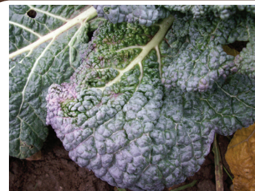
Cabbage leaf running short of phosphorous